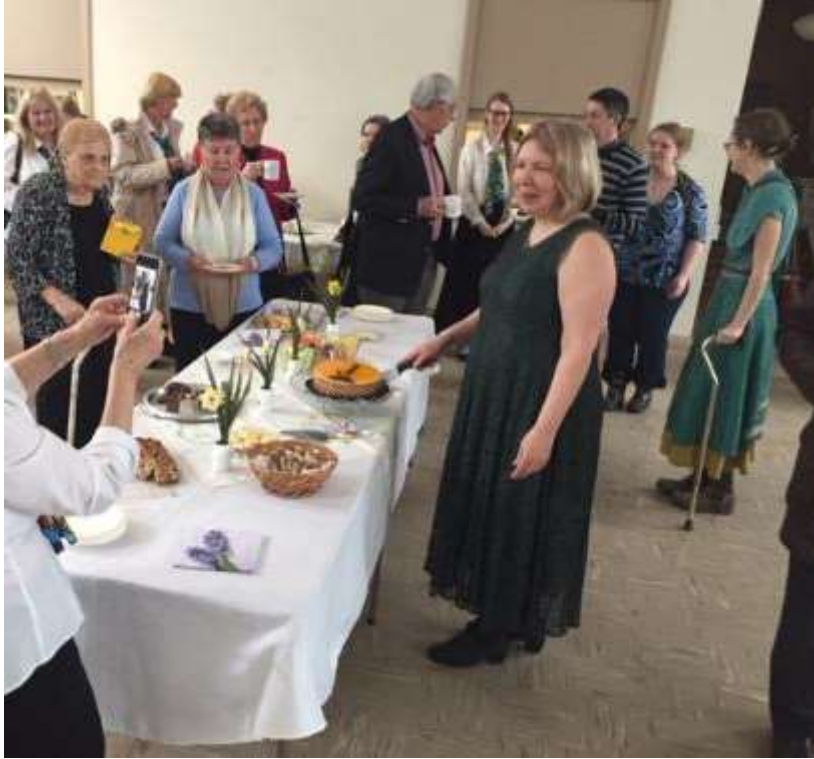
At the reception after the service with the cutting of a particularly delicious cake inscribed with Croeso . Thanks to the ladies who put together the refreshments.