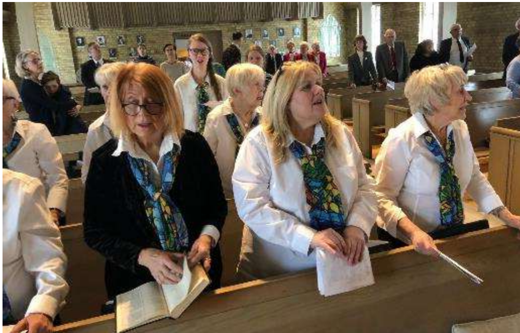
Merched Dewi and the congregation on March 3.

Please send in your contributions by March 28 which is the cut-off date for submissions to the next issue.